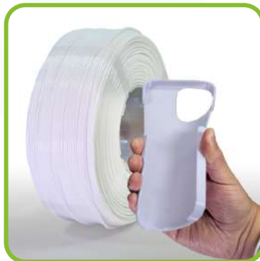
Milky White LTP18A05K12