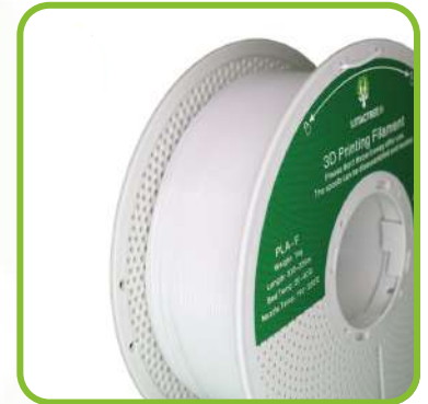
Snowy White LTP01A00K11