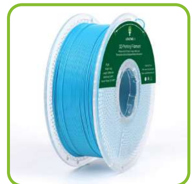
Light Blue LTP01E10K11 (Old Pink Blue)