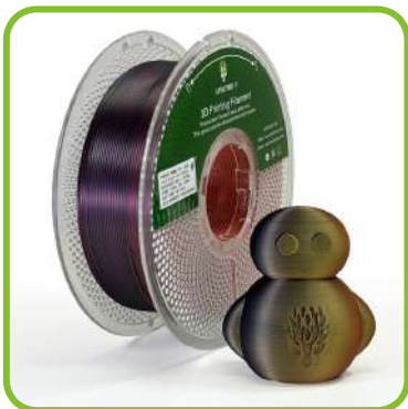
Black & Red & Orange LTP09J13K11