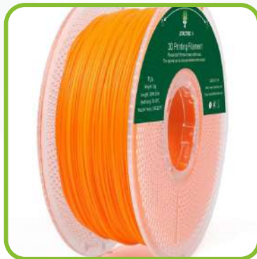
Neon Orange LTP01C04K11