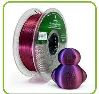
Black & Red & Purple LTP09J02K11