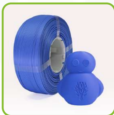
Lake Blue LTP01E01K12