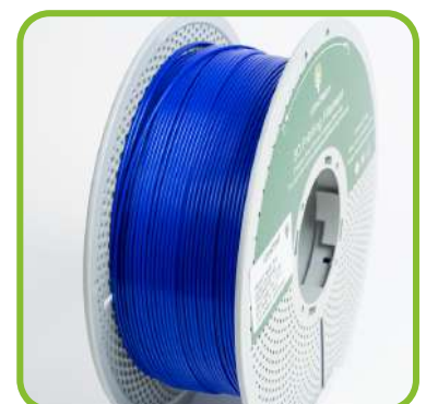
Klein Blue LTP01E00K11