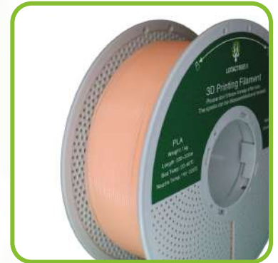
Flesh Color LTP01B04K11