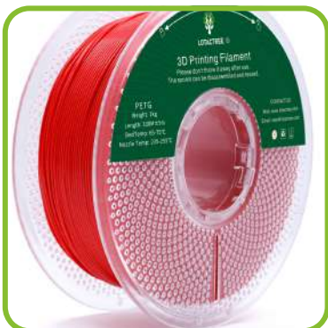
Chinese Red LTG01B00K11