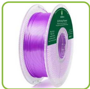
Purple Red LTP09G14K11