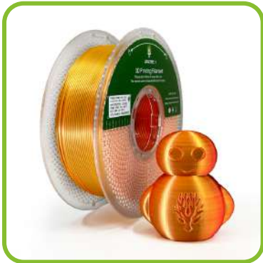
Red & Orange & Gold LTP09J03K11