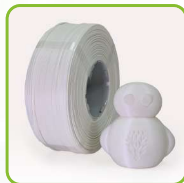
Warm White LTP01A03K12