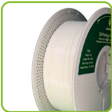
Warm White LTP01A03K11