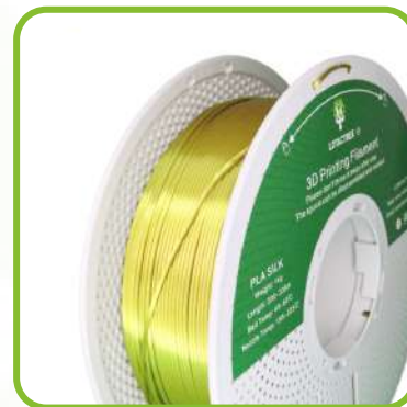
Greenish Gold LTP09G08K11