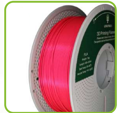
Neon Hot Pink LTP01B06K11 (Old Neon Red)