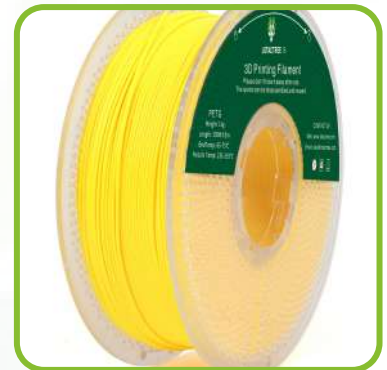
Lego Yellow LTG01C01K11