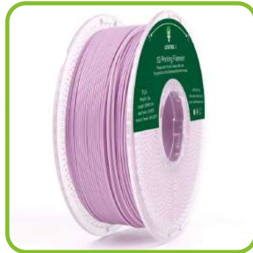
Light Purple LTP01E03K11