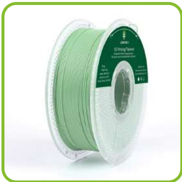
Mint Green LTP01D00K11