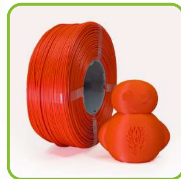
Neon Orange LTP01C04K12