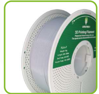
Cool Grey LTP04A02K11