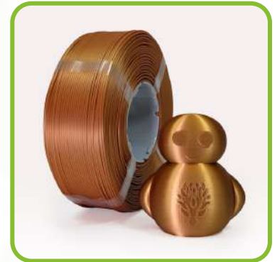
Deep Gold LTP09G17K12