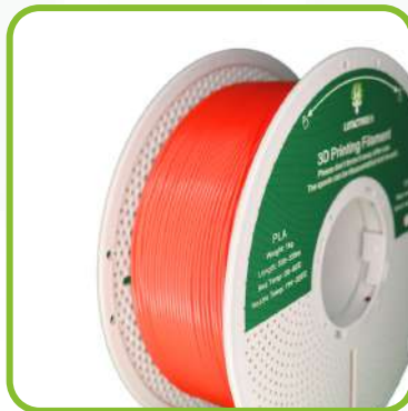
Red LTP04B00K11 (Old Chinese Red)