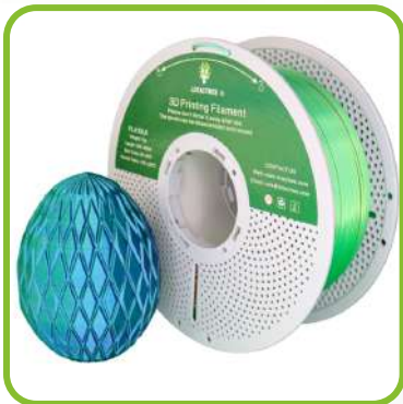
Rose Red & Green & Sky Blue LTP09J01K11