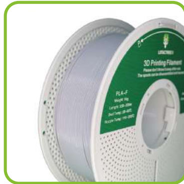
Cool Grey LTP01A02K11