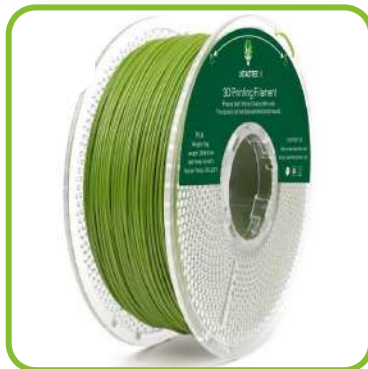
Army Green LTP01D01K11