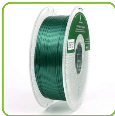
Ink Green LTP09G07K11