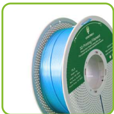
Sky Blue LTP09G10K11