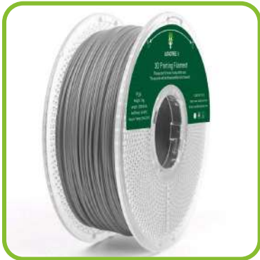
Metallic Grey LTP01A04K11