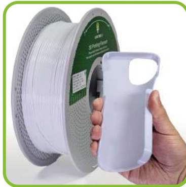
Milky White LTP18A05K11