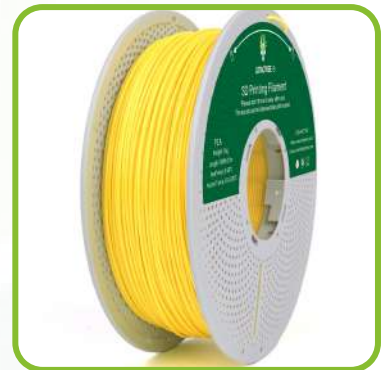
Neon Yellow LTP01C03K11