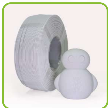
Milky White LTP01A05K12