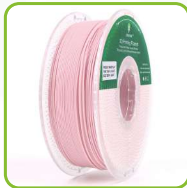
Light Pink LTP01B01K11 (Old Pink White)