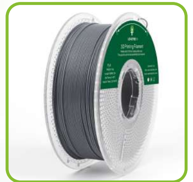
Concrete Grey LTP01A06K11