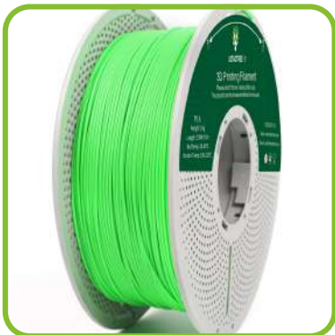
Neon Green LTP01D04K11