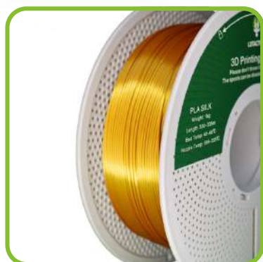
Deep Gold LTP09G17K11