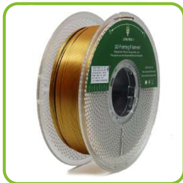
Black & Deep Gold LTP09H02K11