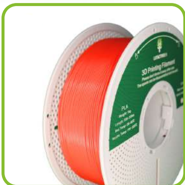
Red LTP01B00K11 (Old Chinese Red)