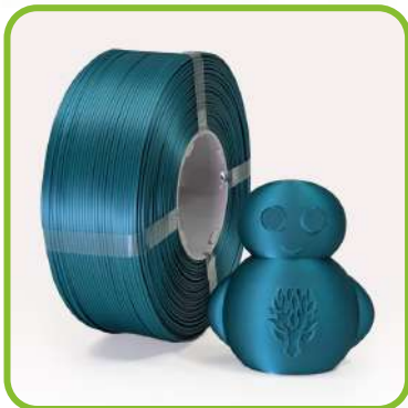
Ink Green LTP09G07K12