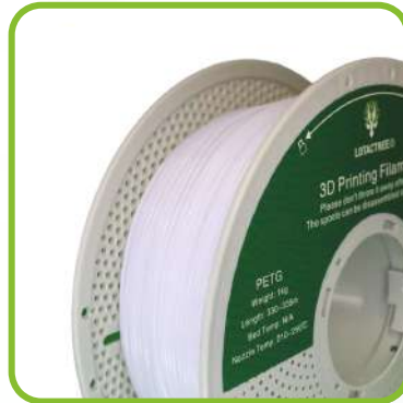
Snowy White LTG01A00K11