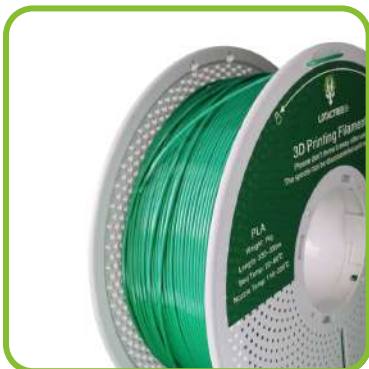
Forest Green LTP01D05K11