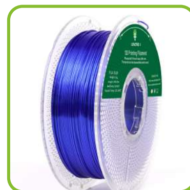
Dark Blue LTP09G09K11