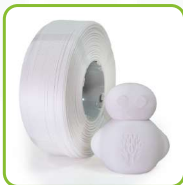
Snowy White LTP01A00K12