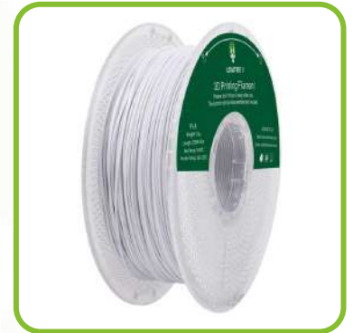
Milky White LTP01A05K11