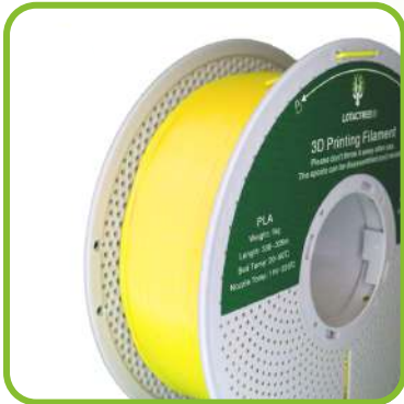
Lego Yellow LTP01C01K11