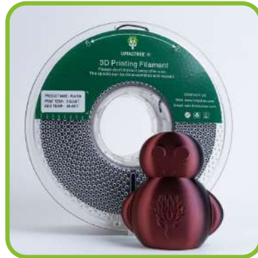
Black & Red LTP09H03K11