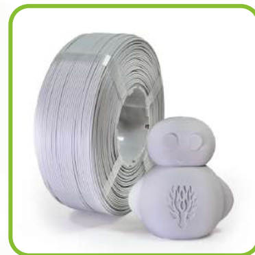
Cool Grey LTP01A02K12