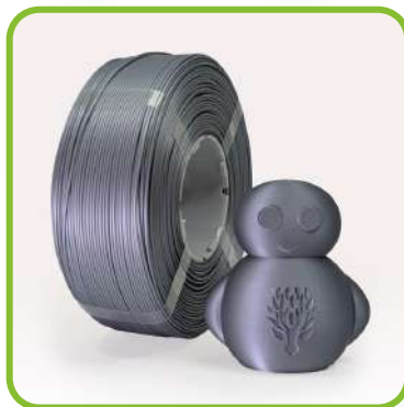
Concrete Grey LTP01A06K12