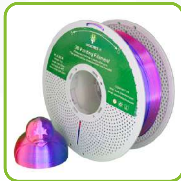
Rose Red & Green & Dark Blue LTP09J00K11