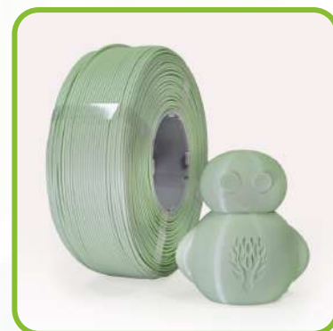
Mint Green LTP01D00K12