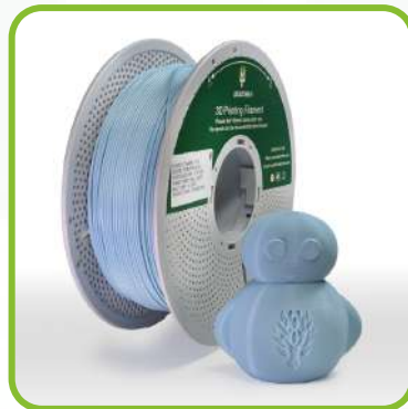
Powder Blue LTP01E12K11