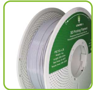
Cool Grey LTG01A02K11