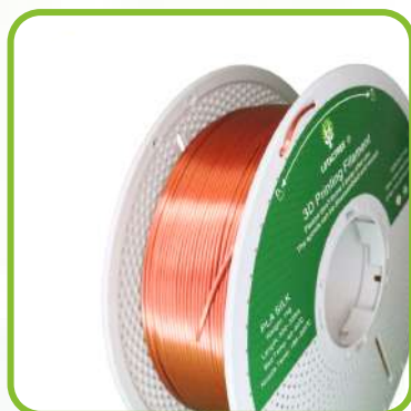
Red Copper LTP09G11K11