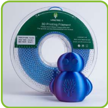
Rose Red & Sky Blue LTP09H12K11