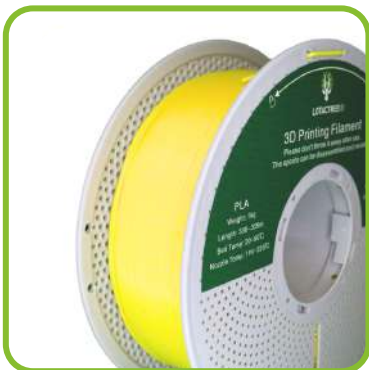
Lego Yellow LTP04C01K11