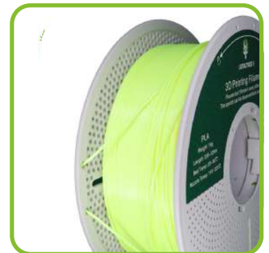
Acid Yellow LTP01C02K11 (Old Lemon Yellow Green)