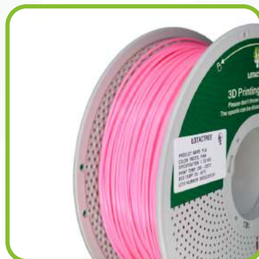
Pastel Pink LTP01B05K11