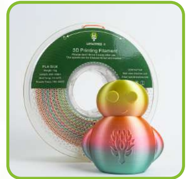
Rainbow Candy LTP09J07K11