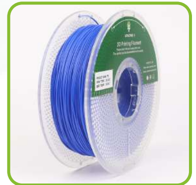
Lake Blue LTT01E01K11