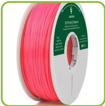
Neon Pink LTP01B07K11 (Old Neon Rose Red)