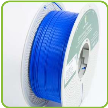
Lake Blue LTP01E01K11