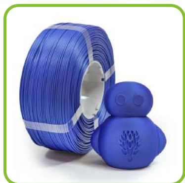
Klein Blue LTP01E00K12