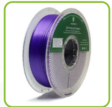
Black & Purple LTP09H06K11